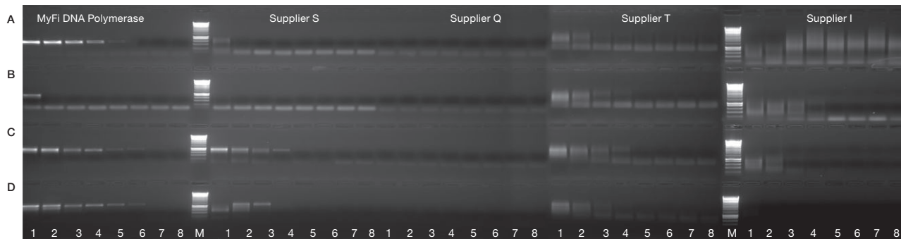
Fig. 2 Greater reliability with GC-rich DNA

A) A 525bp fragment of human epidermal growth factor receptor ( EGFR ) gene (62% GC), B) a 750bp fragment of translation factor p64 ( myc ) gene (64% GC), C) a 900bp fragment of angiotensin II receptor type I ( AGTR1 ) gene (43% GC), D) a 1.2kb fragment of EGFR gene (62% GC), were amplified using MyFi DNA Polymerase and the results were compared with amplifications using high-fidelity hot-start DNA polymerases from other suppliers. A serial dilution of human genomic DNA (5ng, 1ng, 200pg, 40pg, 8pg, 1.6pg, 0.32pg and 0pg, lanes 1-8 respectively), was incubated for 3 min at 95°C (or according to the manufacturer's protocol) followed by 35 cycles of 15s at 95°C, 57°C and 72°C respectively. Marker is HyperLadder I (M). The results illustrate that MyFi out-performed high-fidelity polymerases from other supplier in this complex human genomic DNA assay.